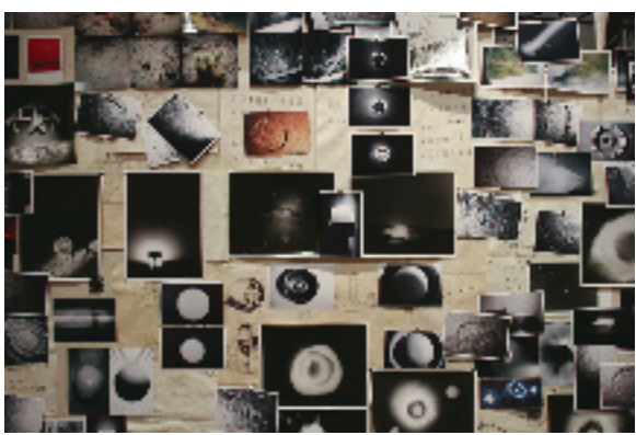
(Top) Roman de Salvo, Circus III, (Bottom) Lael, Corbin, Albedo-Frame effect (Afe-77)