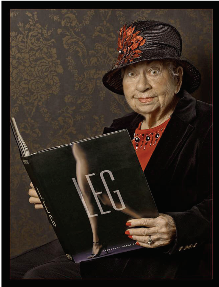
Oh My! 2012 24 by 30 inches $800