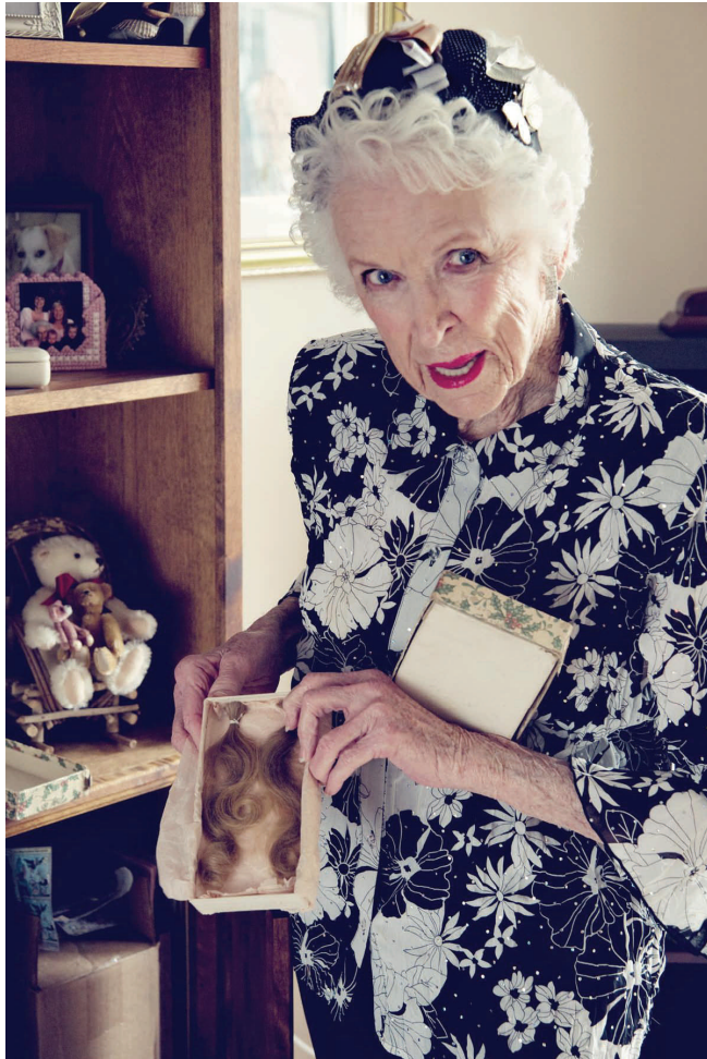
I Used to be a Brunette, 2012 Photograph by Melissa Au 24 by 30 inches $350