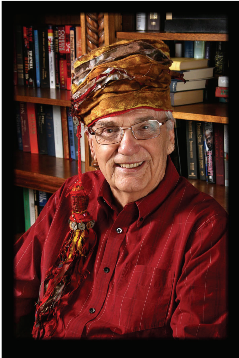
Layered Journey, 2012 Digital Color Photograph by Erika Johnson 24 by 30 inches $300