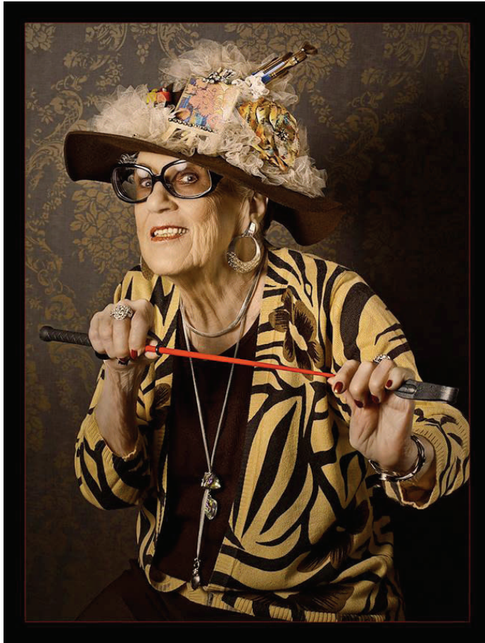
Prepare Yourself Boys...2012 Photo by Raymond Elstad 24 by 30 inches $800