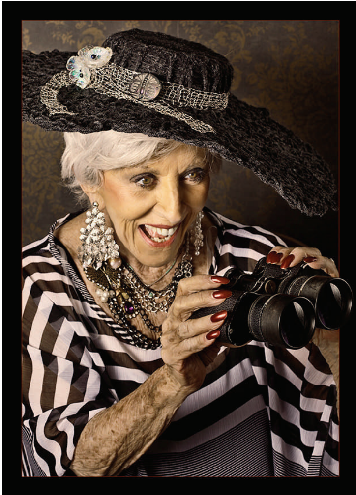
Hitting the Trifecta, 2012 Photograph by Raymond Elstad 24 by 30 inches $800