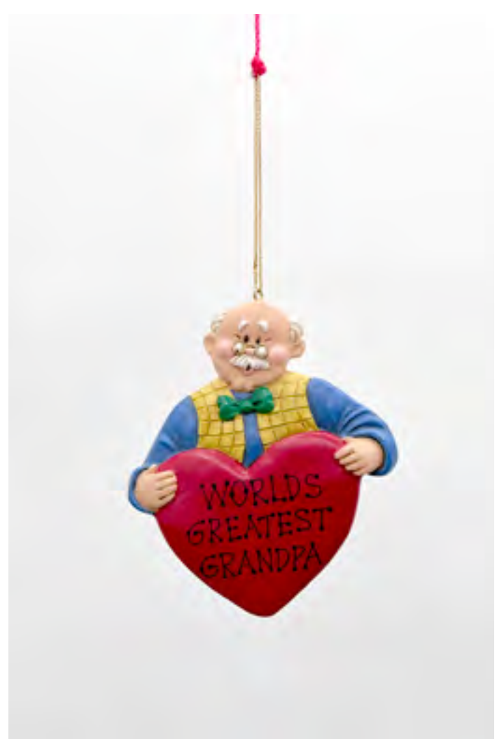
FIGURE 6 FIGURE 7