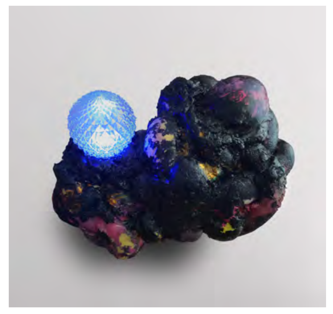
Figures 4-6 Post Human Accumulations 2023

mixed media, glass, and electrical components (colored light) 3 small scale floor sculptures of plastiglomerate, light and wood dimensions variable