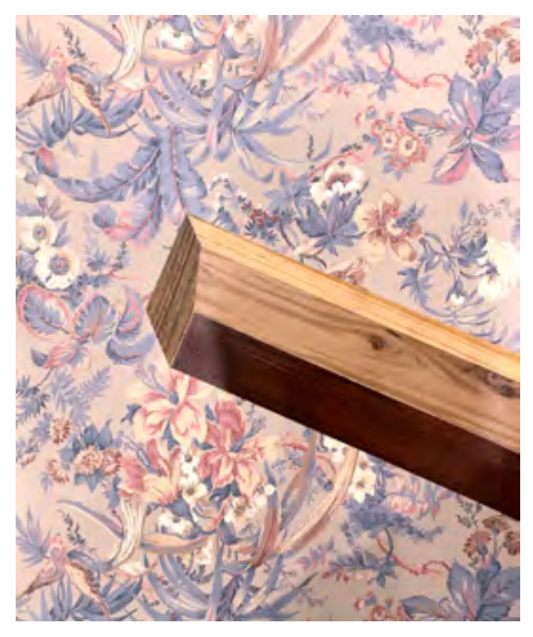
Figure 4 Untitled collage