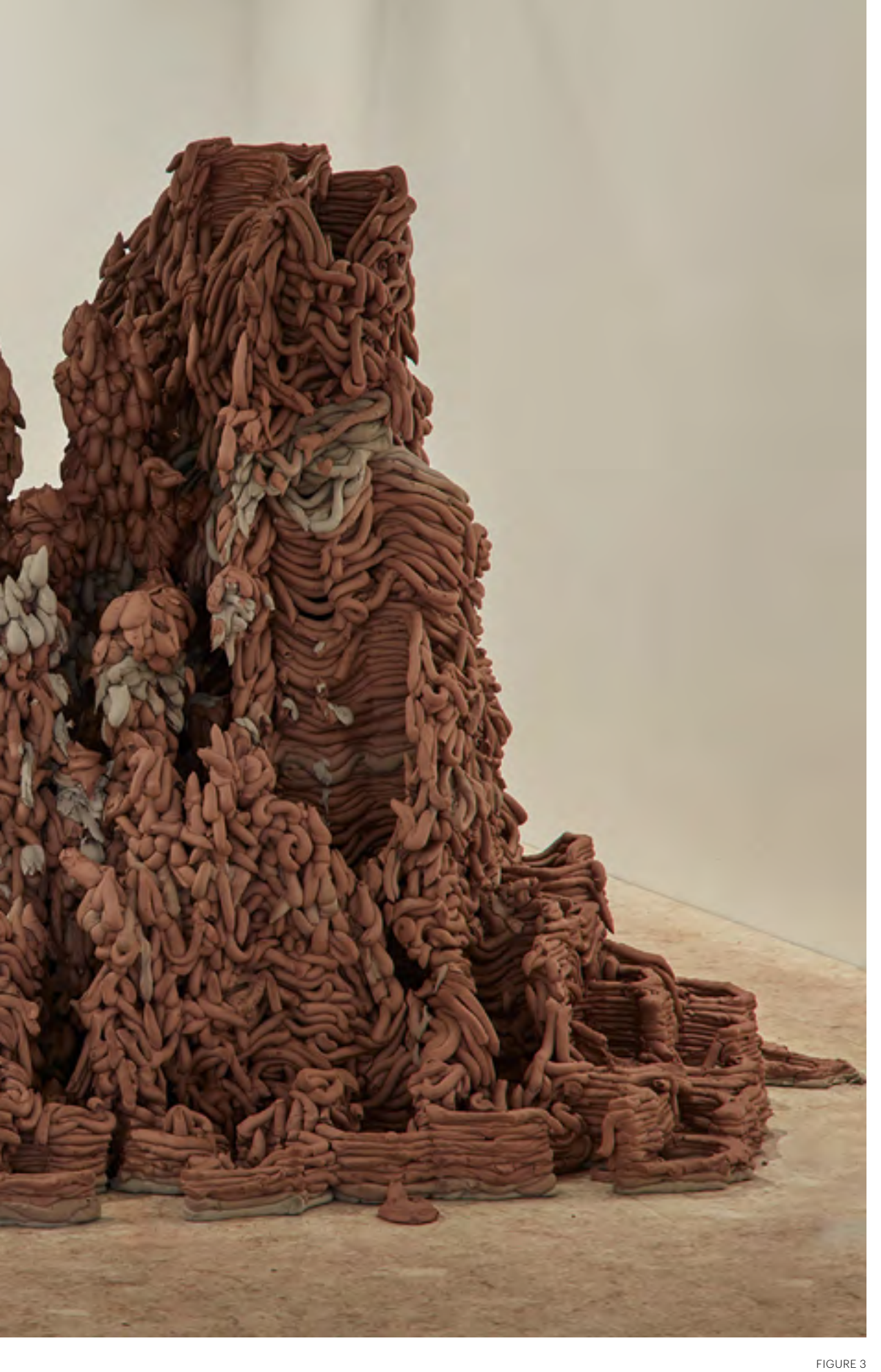
Figure 3 Beautiful Minds 2015–2017

aluminium, clay, pump, software 196 7/8 x 196 7/8 x 196 7/8 inches © Anya Gallaccio